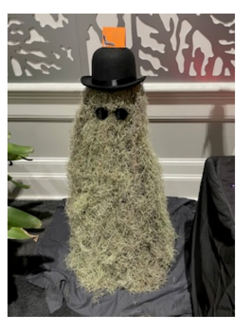
"Cousin Itt was a Hitt"